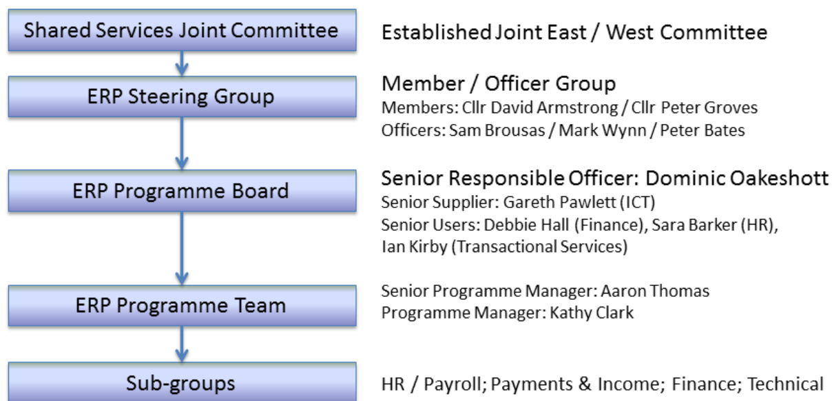
Figure 2: Programme Governance